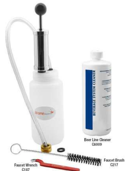
Cleaning Kit C6010